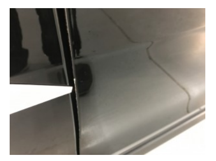
Front left door - Paint repair