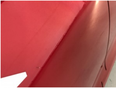
Rear right door - Scratch