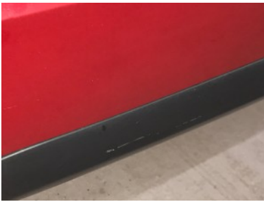
Rear bumper - Scratch