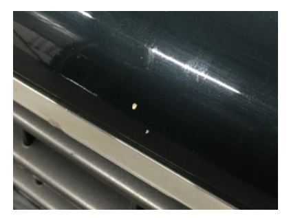
Bonnet - Paint repair