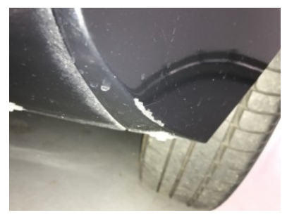
Rear bumper - Paint repair