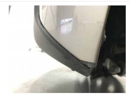
Front bumper - Paint repair