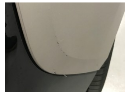
Rear bumper - Paint repair