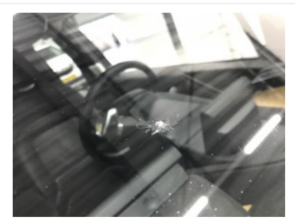
Windscreen - Pip