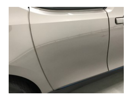
Rear right door - Paint repair